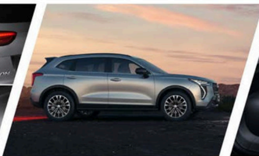
2700mm Long Wheelbase