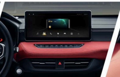
12.3-Inch smart Touch Screen Resolution up to 1280 * 720