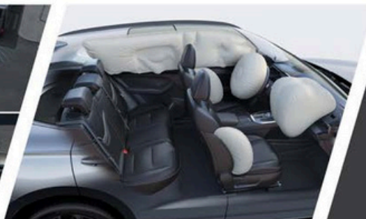
6 Omni-Directional Airbags