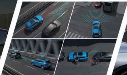
Intelligent Automatic Driving System