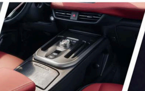
Wireless charging+Wired Apple CarPlay® & Android Auto™