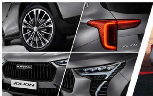
Fashionable and Dynamic Exterior Design